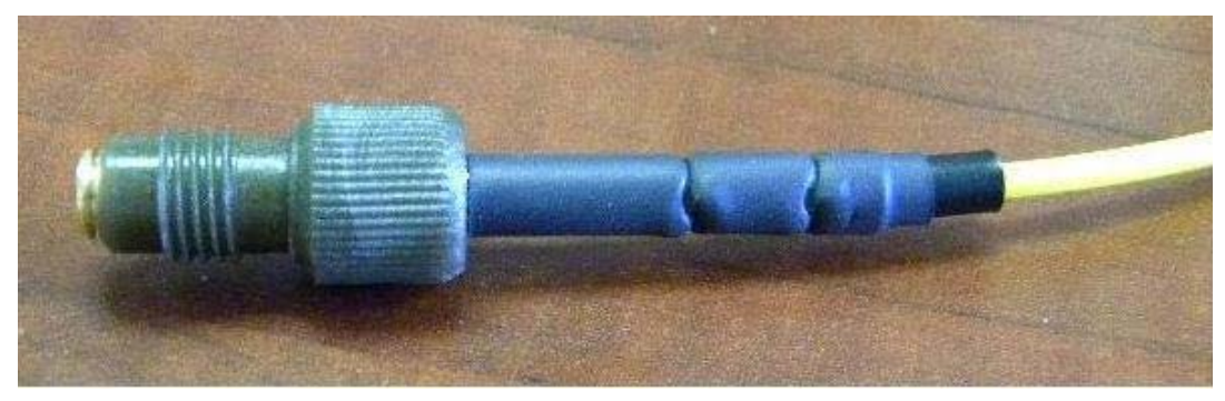
Stop Fumbling With Shotgun Primers in the Dark!