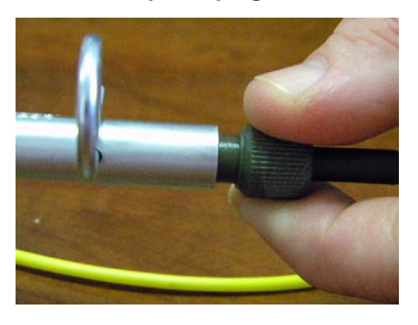
Works with both dual and single firing devices.

Can be attached to any standard shock tube by the user with a standard cap crimping tool.