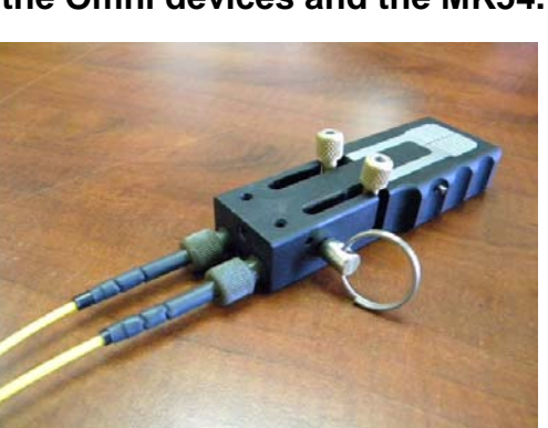
Ready to use with preloaded primer. No more shotgun primers to deal with.

Has standard 7/16" diameter by 20 threads per inch, common to most firing devices, including the Omni devices and the MK54.